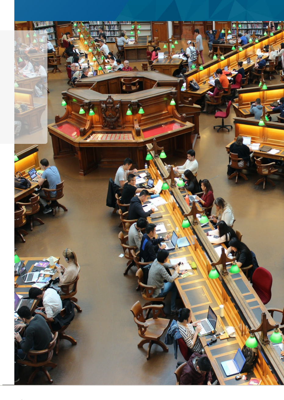
Page 1 | Hyper-Converged Solution